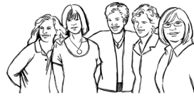
United Methodist Women